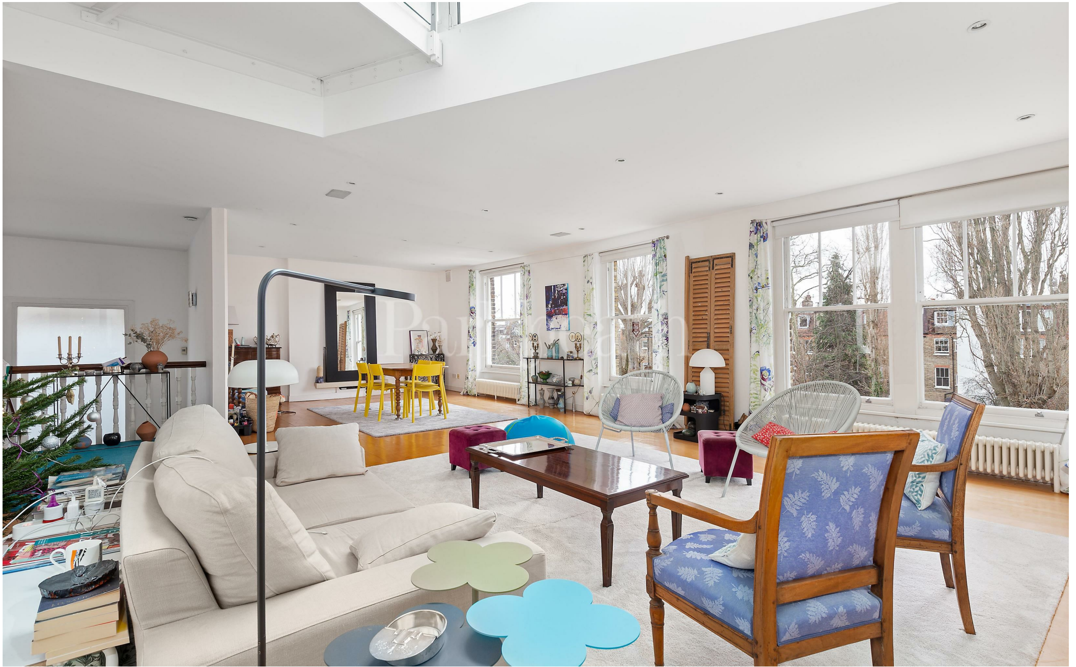
Canfield Gardens NW6